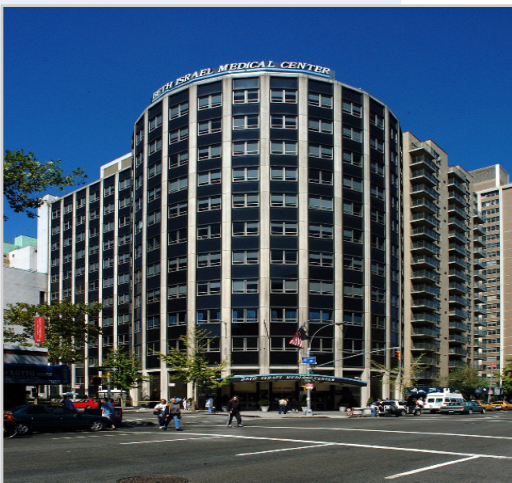
Beth Israel Medical Center

Continuum has effectively eliminated the need to do traditional disaster recovery should a calamity happen. Whereas many IT organizations normally go through a painful process of assembling resources to recover data following a site-wide outage, the metro clusters at Continuum Health Partners allow them to take over operations from their hot site uninterrupted.